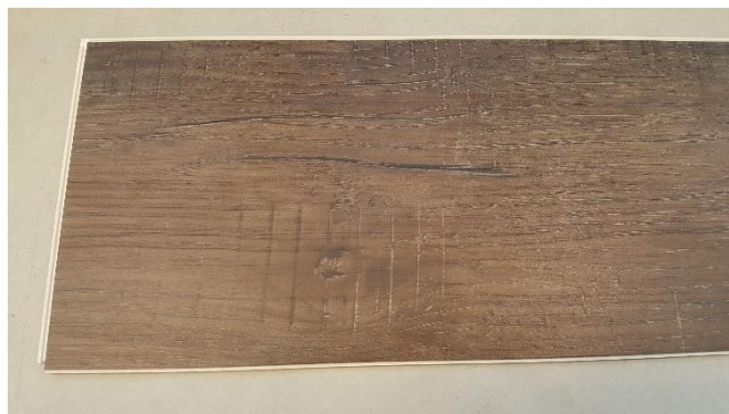
Figure 1: Picture of the received sample (surface)